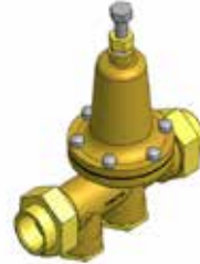
3D Image of Watts 3/4" Pressure Reducing Valve