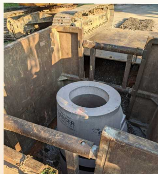
Above left: Beaver Creek Trunk Line - Phase 1